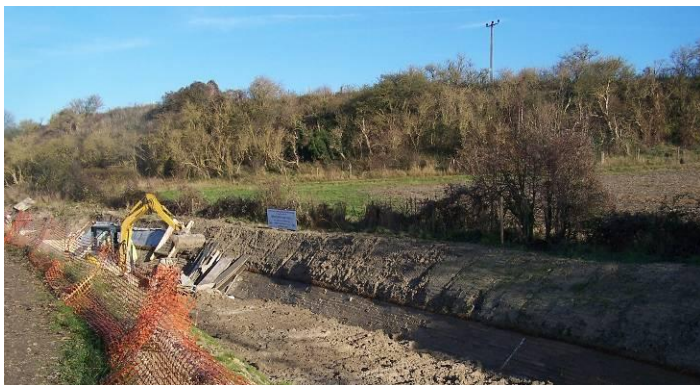
THE END OF STAGE 2 IS THE BUSH ON THE OFFSIDE WITH MARKER POST IN FRONT

As you are already aware we are leaving the next re-watering until the re-lining reaches Bridge 4A as it will be easier to construct the next bund in the bridge narrows although care will have to be taken so that a dredger can remove the bund in future whilst working clear of the bridge span.