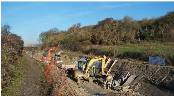
WORK ON STAGE 3 IS PROGRESSING WITH BRIDGE 4 IN THE BACKGROUND