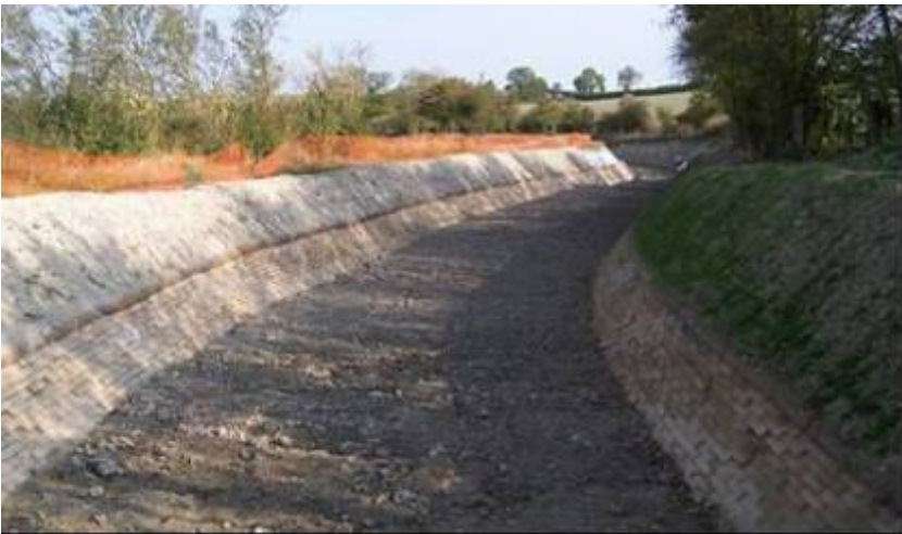
The bank top covered with spoil and sown with grass seed, the bed lined with bentomat and covered in spoil all ready for re-watering