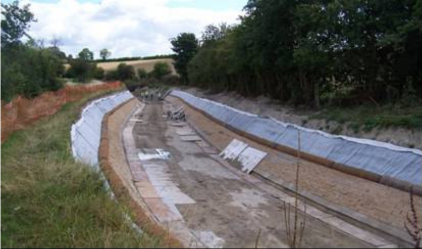
The banks lined with bentomat and the concrete blocks and coir rolls in position

flowing from Wendover to Drayton Beauchamp as the plant life is choking the water flow, whereas the regular passage of boats keeps a clear channel with much less harm to wildlife than intermittent reed cutting.