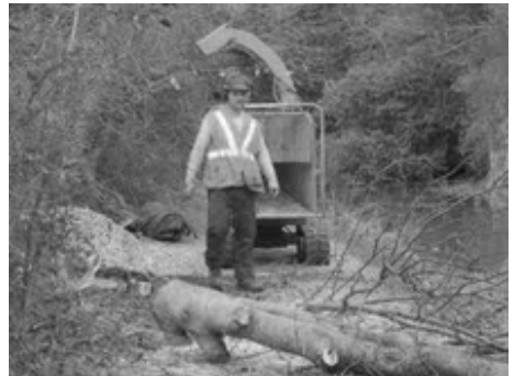
BW Operatives lopping and topping on the Wendover Arm

Towpath maintenance by BW involving the trimming of trees has been carried out in several locations including our own Wendover Arm . It has not met with universal approval, there have been widely publicised objections to the way the pruning has been carried out in some areas.