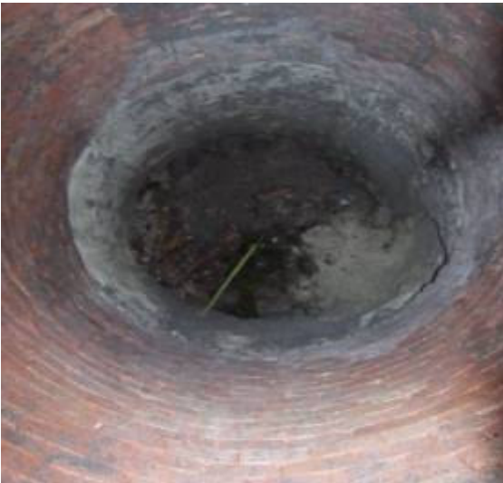
View down the well at Whitehouses