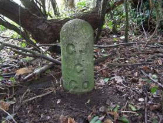
Grand Junction Canal Company boundary marker post found in front of the boundary fence at the back of Whitehouses