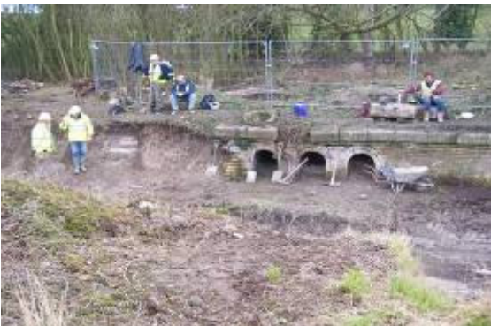
Despite all their hard work at Whitehouses the team did have time for a lunch break!