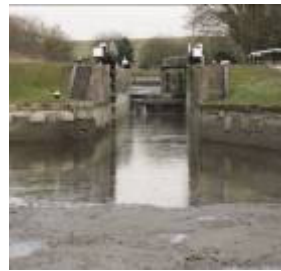
The dry section of the Grand Union canal on Marsworth flight approaching the Tring Summit