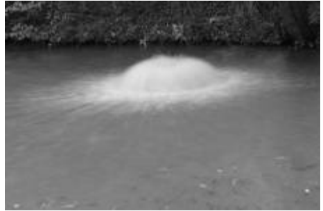
An aerator in action on the Aylesbury Arm

Closer to the town it was necessary to dredge the bottom pound including the basin area. The usual bicycles and shopping trolleys were removed (why do people always chuck them in?) This work inevitably disturbs the bottom and causes the water to become saturated with solids thus reducing its oxygen content and making it a hazardous place for the fish. To mitigate an aerator was employed but there were still a number of dead fish in evidence although they were quickly removed by BW operatives.