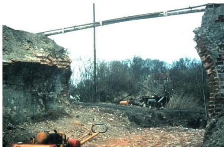
Destruction in 1973

The pictures below illustrate a couple of achievements by the Wendover Arm Trust volunteers –re-building Little Tring Bridge and re-watering a section of canal.