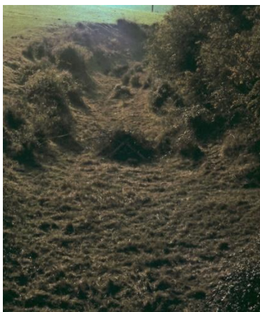
West of Little Tring bridge 1996