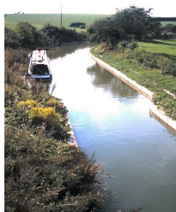
West of Little Tring bridge 2007

Thank you for your interest and support!